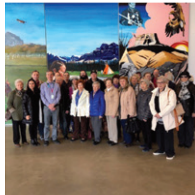
Our seniors visit the new Calgary Central Library