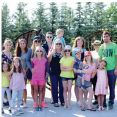
Our clients in the Resettlement and Integration program make a trip to the zoo.