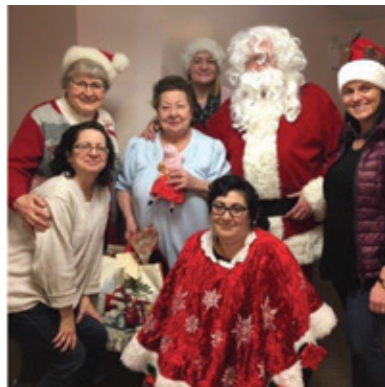
Santa's Secret Service delivers gifts to our seniors