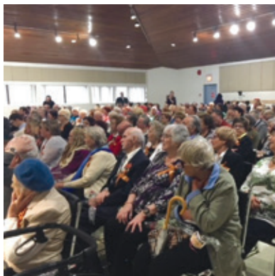
May 9th celebration honoring war veterans