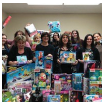
Our team with gifts donated by the community for families in need during our annual Toy Drive