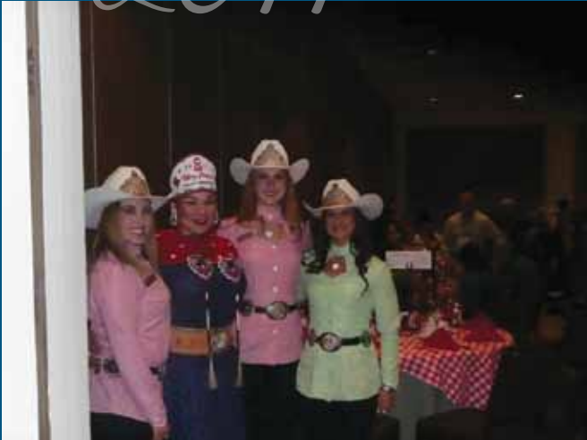
Stampede Queen and Princesses.