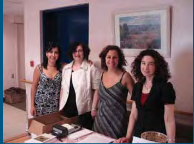
Launch of "Voices of Resilience".