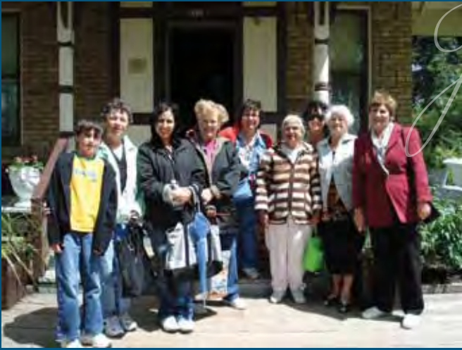
Seniors at Heritage Park last summer.