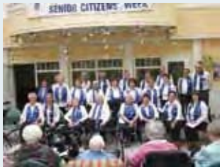
"Voices" Seniors Choir at the Beverly Centre.

This year volunteers have staffed JFSC's reception desk and delivered and organized food items at JFSC's kosher food pantry as well as Miriam's Well. Volunteers with special language skills have spent their time translating documents,