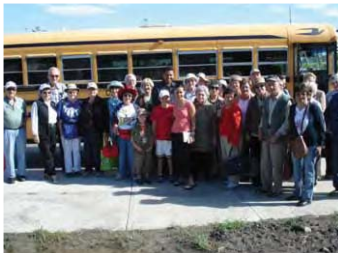
Seniors and newcomers enjoy a field trip.

We are pleased that, from our immigrant community, we have a new doctor, accomplished engineers, medical technicians, IT professionals and other successes including those in the field of childcare and administration.