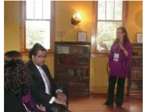
Mayor Naheed Nenshi attending AJFCA conference.

AJFCA 39th Annual Conference May 15-17, 2011 The Westin Hotel Calgary, Alberta